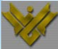
Al Manar TV Channel