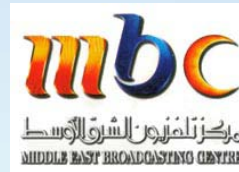
Middle East Broadcast Corporation