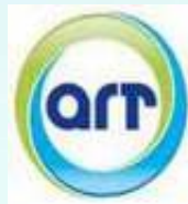
Arab Radio Television