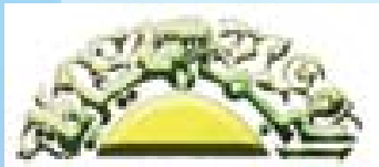
Libya Broadcasting Cooperation